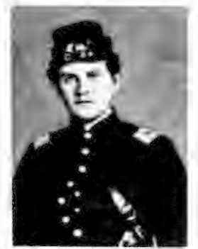
FIRST TIMET, 1940AU W. WIELITT: